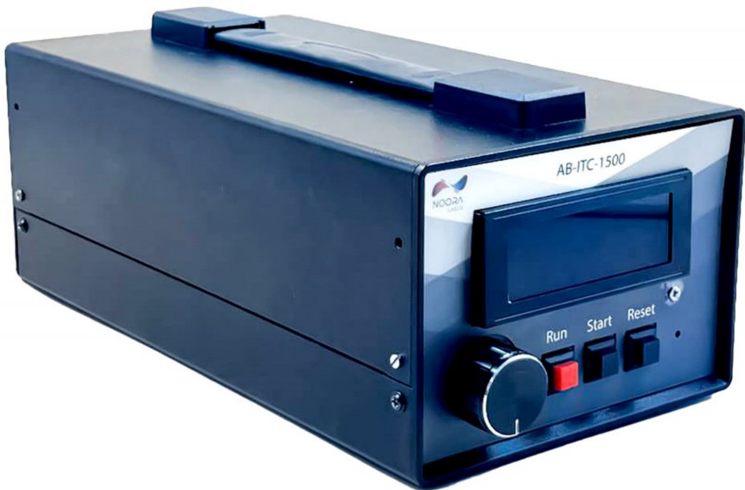
Butterfly-laser Diode and TEC controller AB-ITC-1500